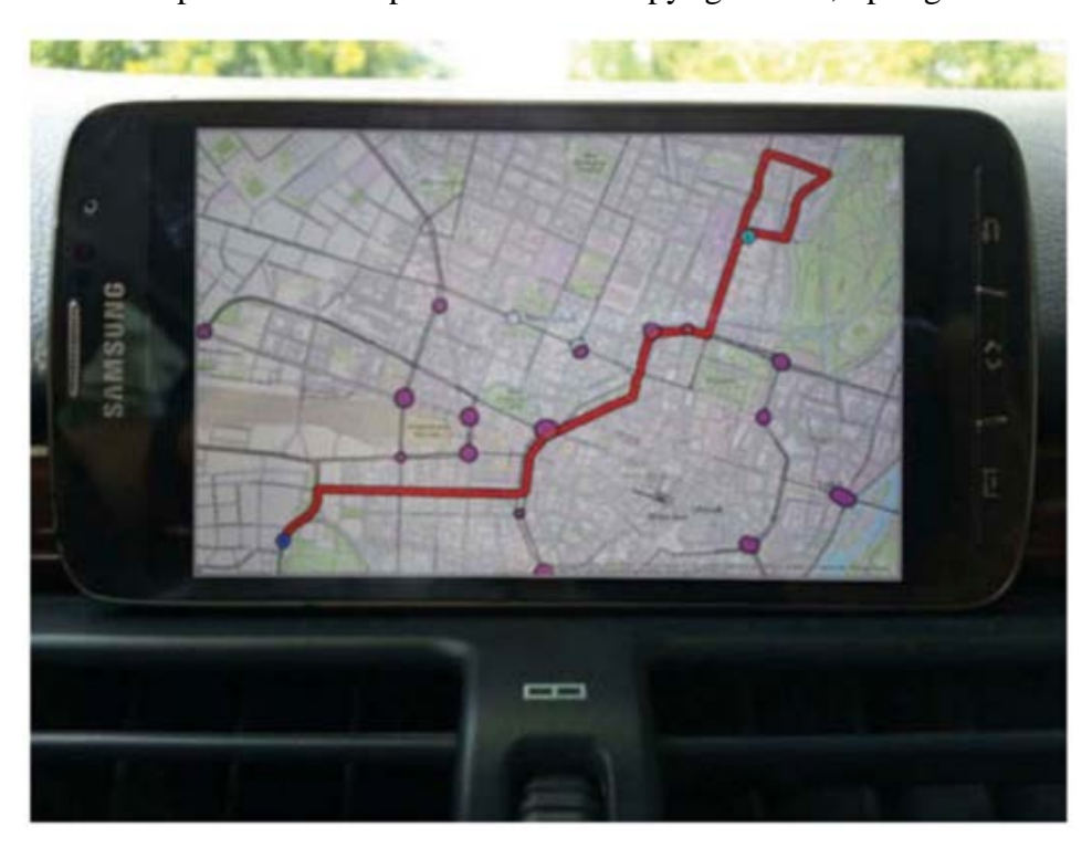
Figure 4. Route plan 2 to the destination. Reproduced with permission. 14 Copyright 2003, Springer.