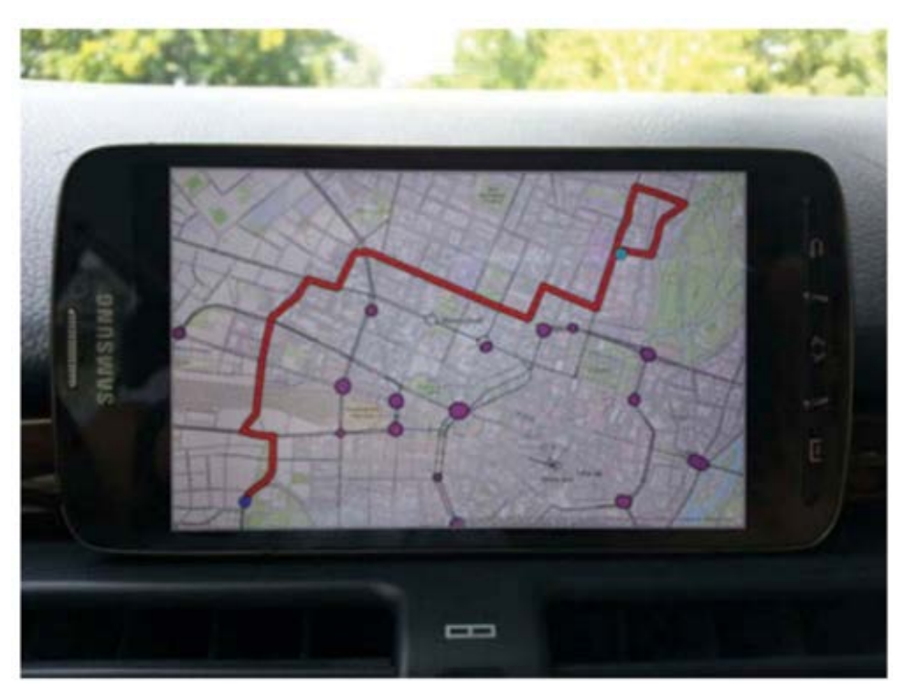
Figure 3. Route plan 1 to the destination.